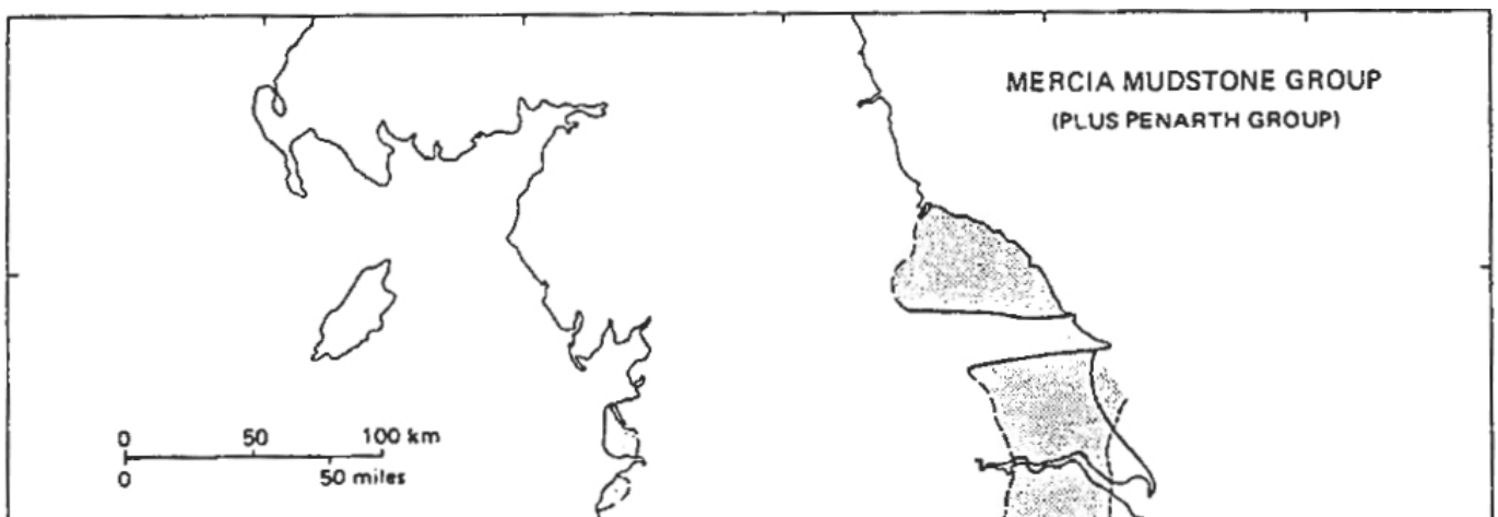
Detail from Chapman et al. 1986, fig. 3; “areas containing potentially suitable Mercia Mudstone Group rocks”.